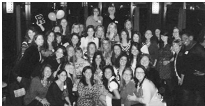
The Class of 2001 celebrated their 10 year reunion on Saturday, November 26, 2011 at Rojo Mexican Bistro in St. Clair Shores.