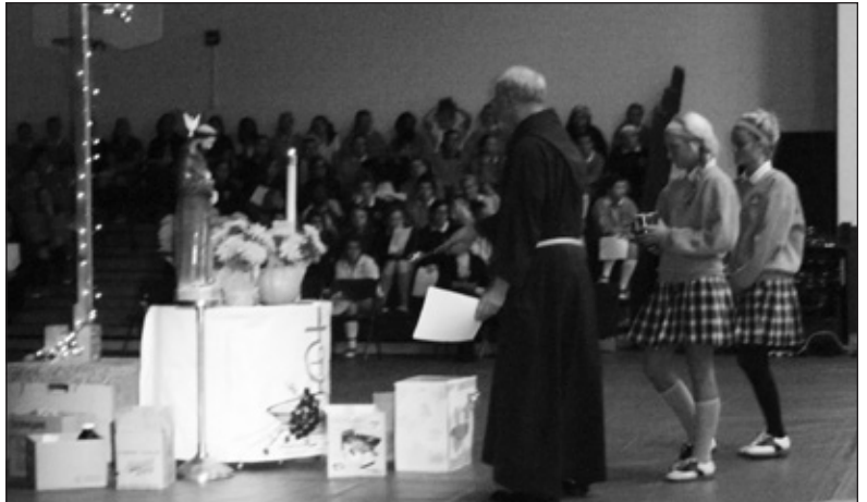
RHS students and staff give back to the community at our Thanksgiving Liturgy with a donation of Food and Supplies.