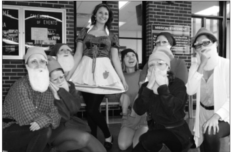
Seniors are in full spirit on Multiples Day!