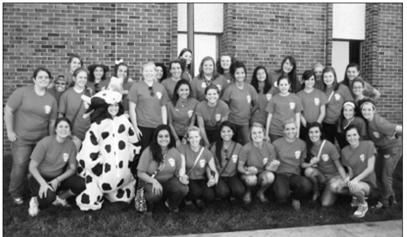
Student Council participated in the FEDS Down Syndrome Buddy Walk.