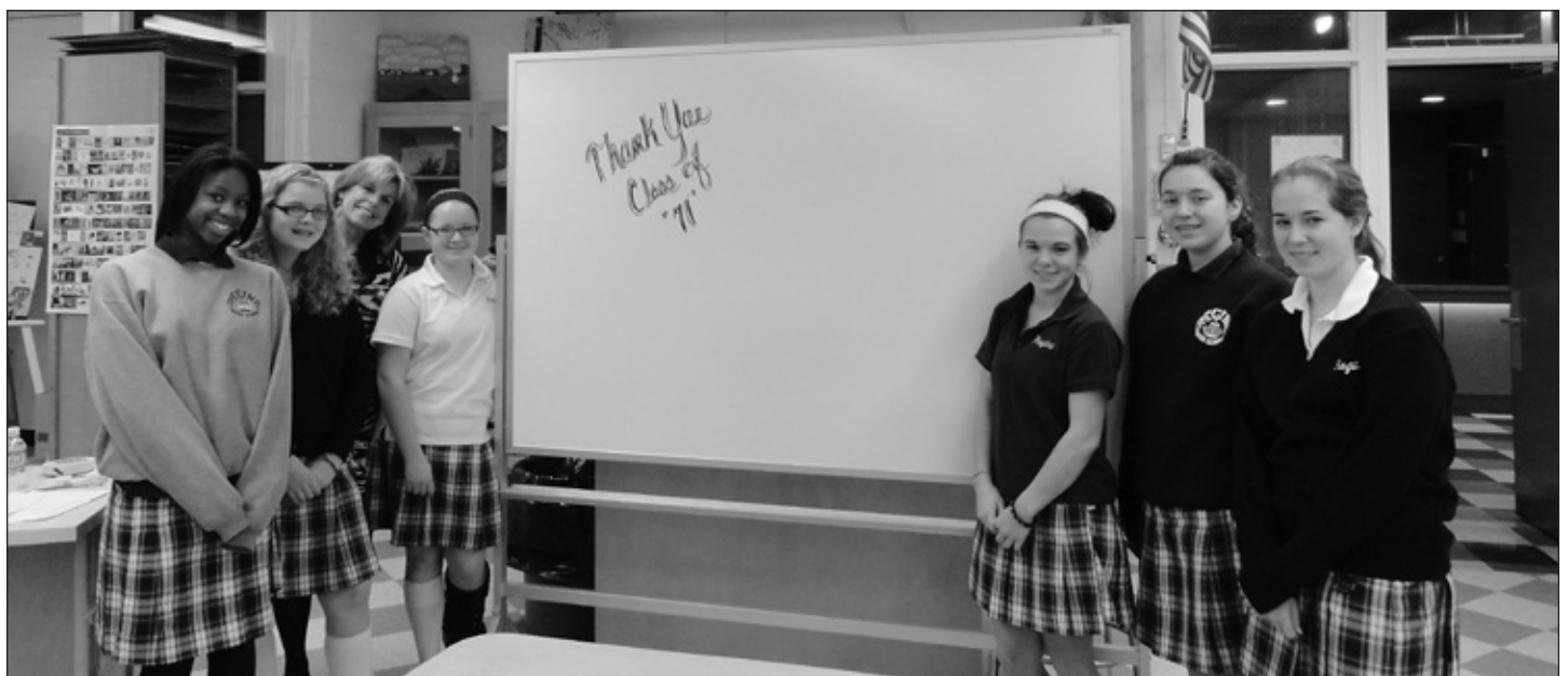
Thank you to the Class of 1971 for your generous donation of 2 portable whiteboards to our school.