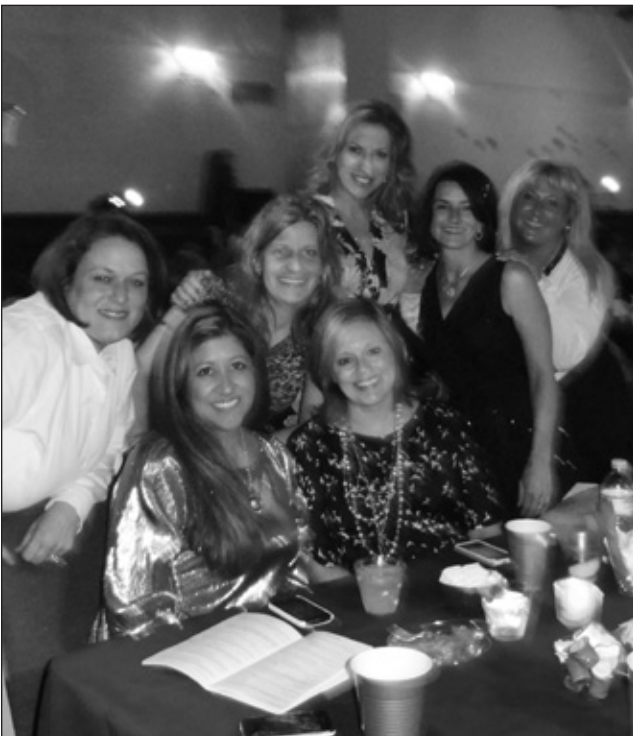
The Class of 1989 enjoys the Auction festivities.