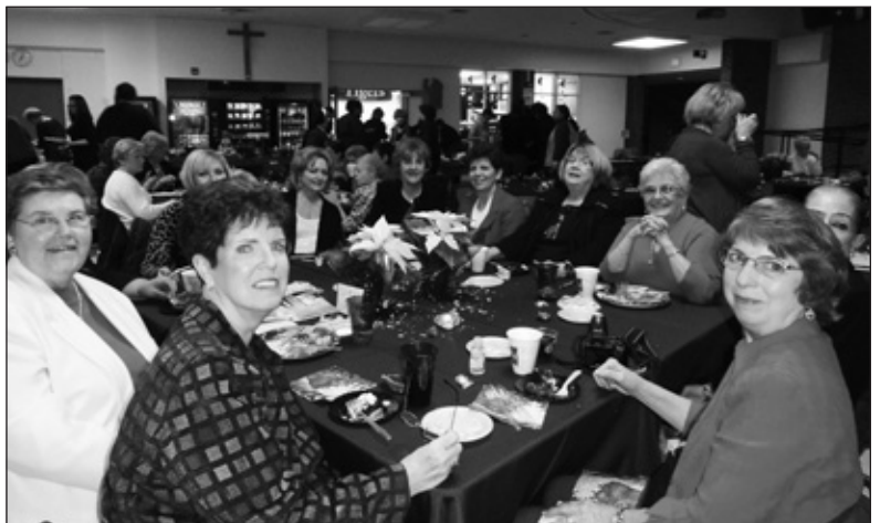
Alumnae reminiscing at the Annual Christmas Party.