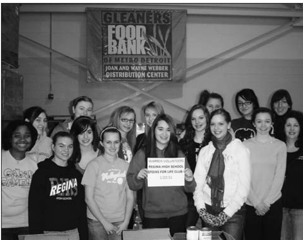
Teens For Life Club.