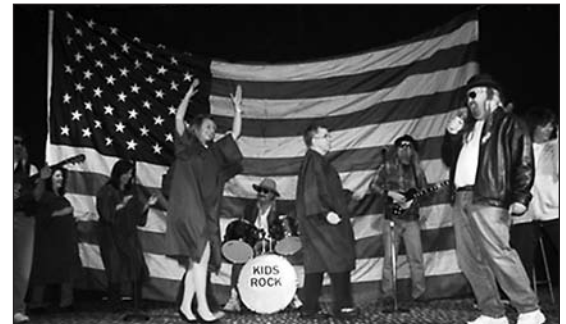
The staff shows their hidden talents as they rock it Kid Rock style to Born Free.