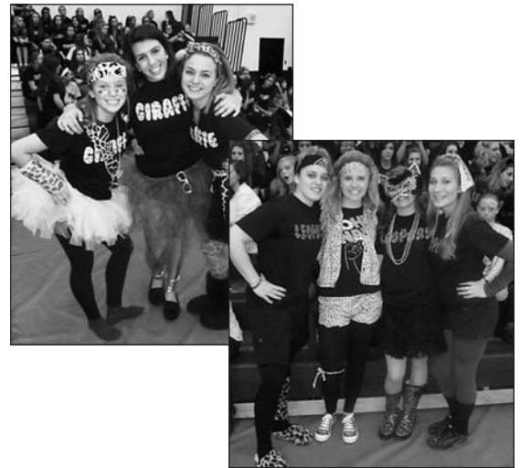
Teams Giraffe and Leopard show their pride.