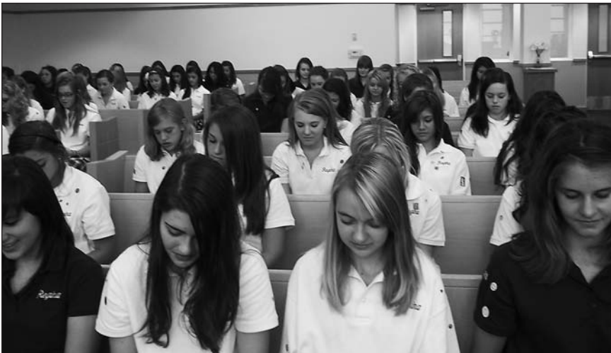
Here the class of 2015 learns the words to Regina Mundi.