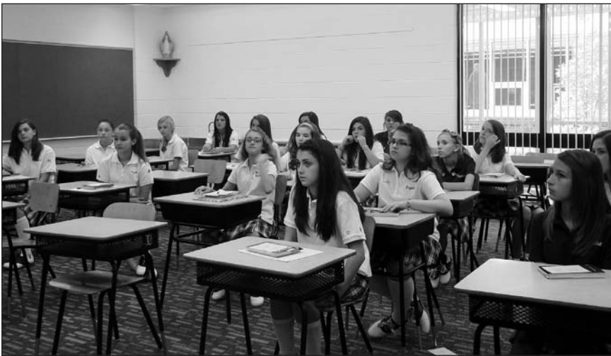
The Freshman class spends their first day exploring.