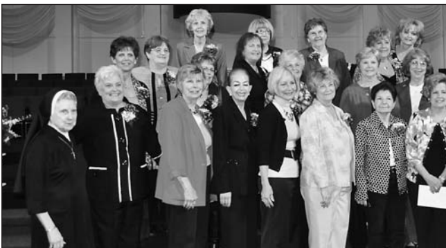
Class of 1961 is honored at graduation.