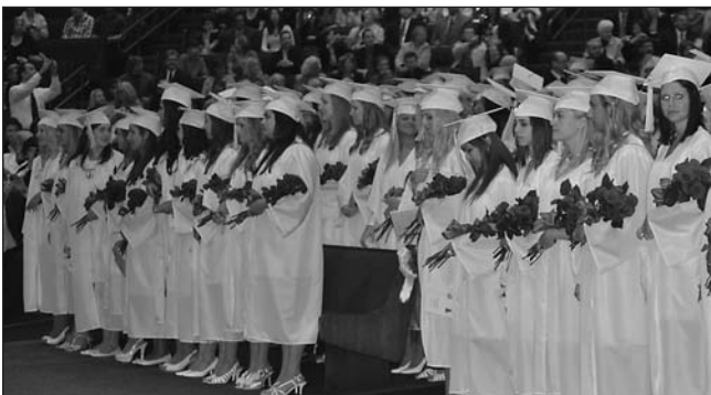
Class of 2011. Good luck with your future and wherever God leads you.