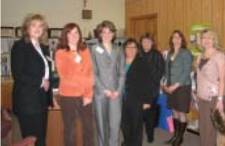
Alumnae return to Regina to give advice to future leaders

A forensic scientist, a journalist, a clinical social worker: These are just a few of the twenty five welcomed guests who presented at Regina's Career Day that was held Friday, March 10 th . Alumnae, parents of former and current students, and interested community members were among the visitors who shared their career pathways and experiences with our students.